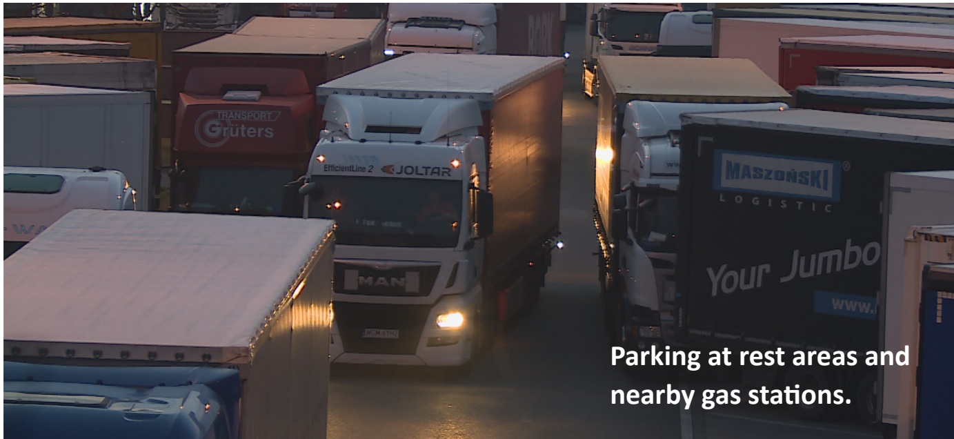
Parking at rest areas and nearby gas stations.

bürgerorientiert • professionell • rechtsstaatlich